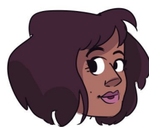
Art by Steenz