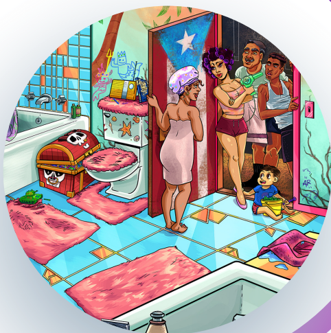
Art by Ashley Ribblett